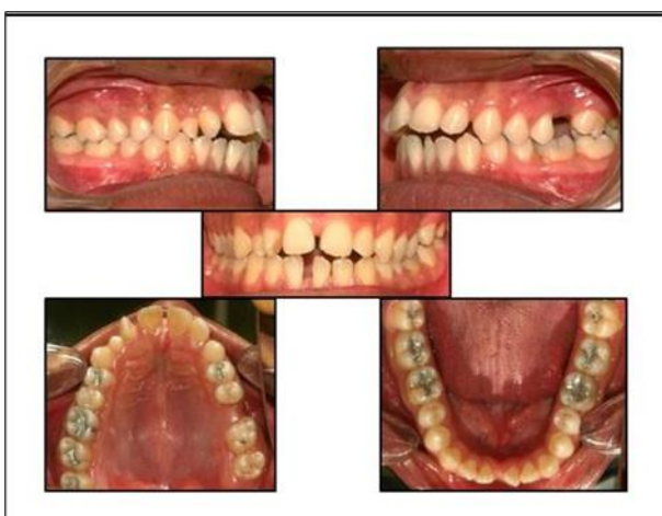
Fig. 1 Pre-operative images, b. Intra-oral images

Shape of head was dolicocephalic with leptoprosopic facial form & posterior divergence, convex profile. Class I skeletal relation was seen.