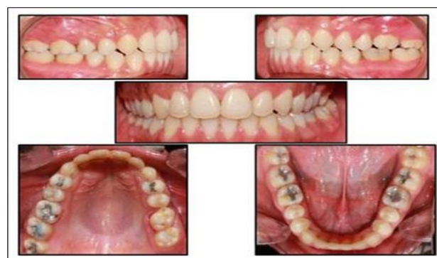
Fig. 4 Post-operative images, b. Intra-oral images