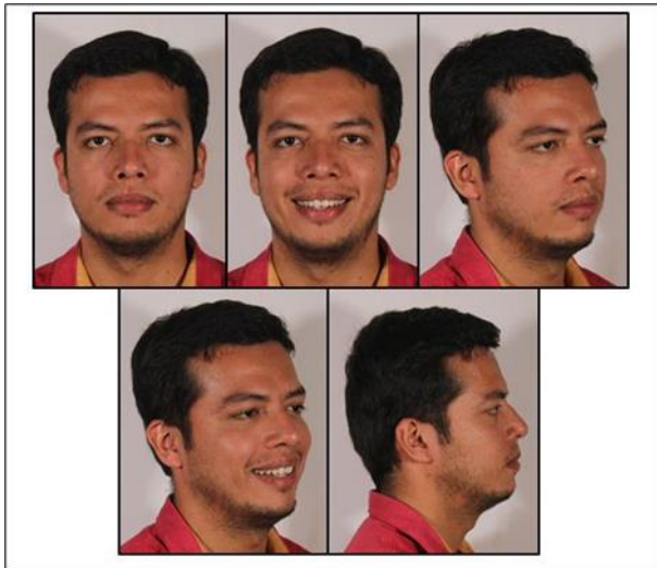
Fig. 6. Five year follow-up images. a. Extra-oral images.