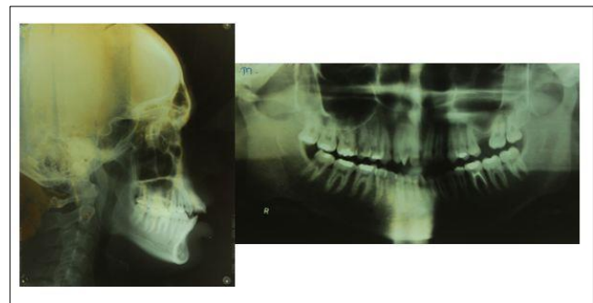
Fig.2- Pre- orthodontic treatment radiographs

Skeletal- Class II skeletal base with prognathic maxilla and orthognathic mandible. (Fig 2)