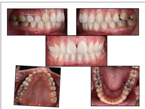
Fig. 6. Five year follow-up images, b. Intra-oral images

Hence, to fully utilize the potential of this technique, accurate treatment planning is crucial. This method belongs in the realm of research and clinical practice where Periodontists and Orthodontists collaborate on every stage of care, from diagnosis to retention.